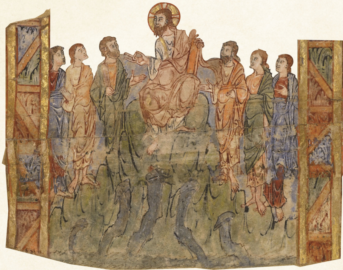
Detail, Anonymous, Christ Teaching , Anglo-Saxon, c. 1000