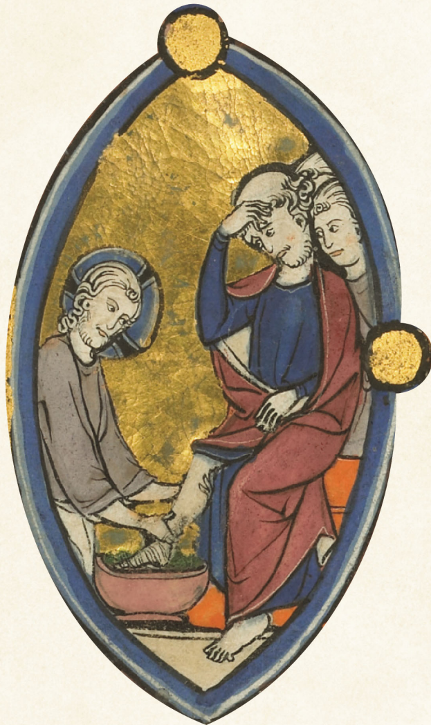
Detail, Anonymous, Christ Washing the Apostles' Feet , Paris, c. 1250-1260