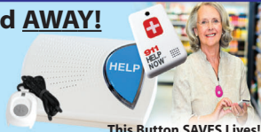
This Button SAVES Lives! As Shown GPS, Lowest Price Guaranteed!